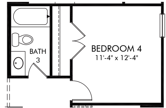
OPT. BEDROOM 4 & BATH 3