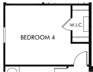
OPT. BEDROOM 4