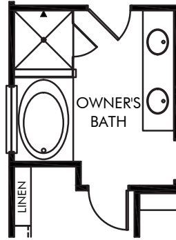
OPT. OWNER'S BATH 1