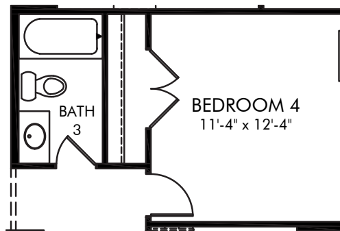
OPT. BEDROOM 4 & BATH 3