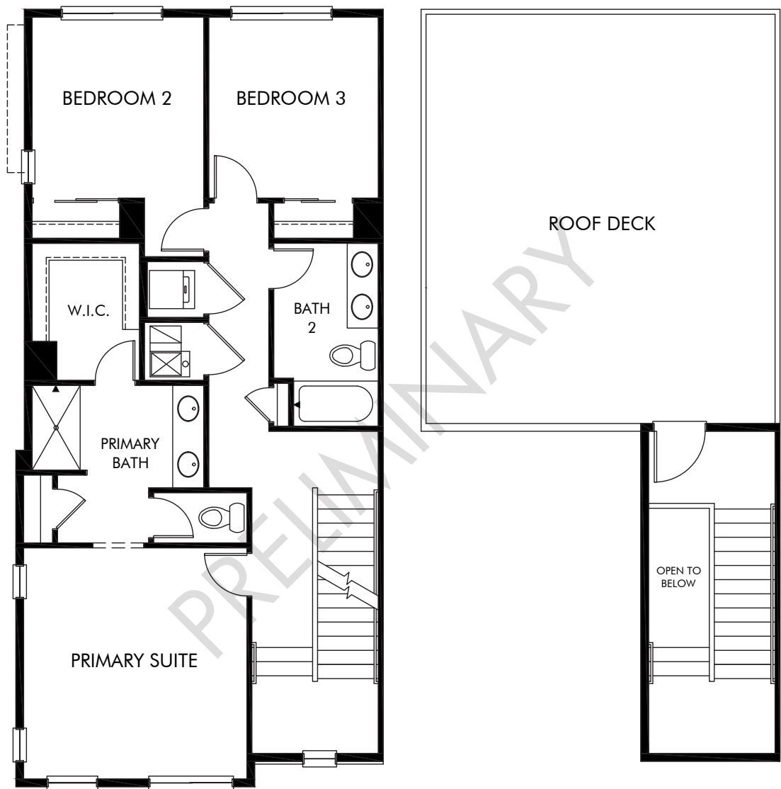
OPT. ROOF DECK