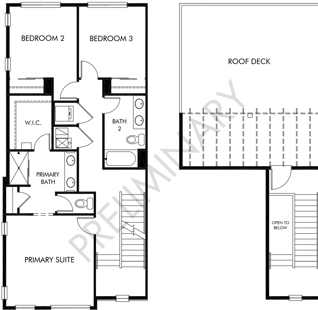
OPT. ROOF DECK