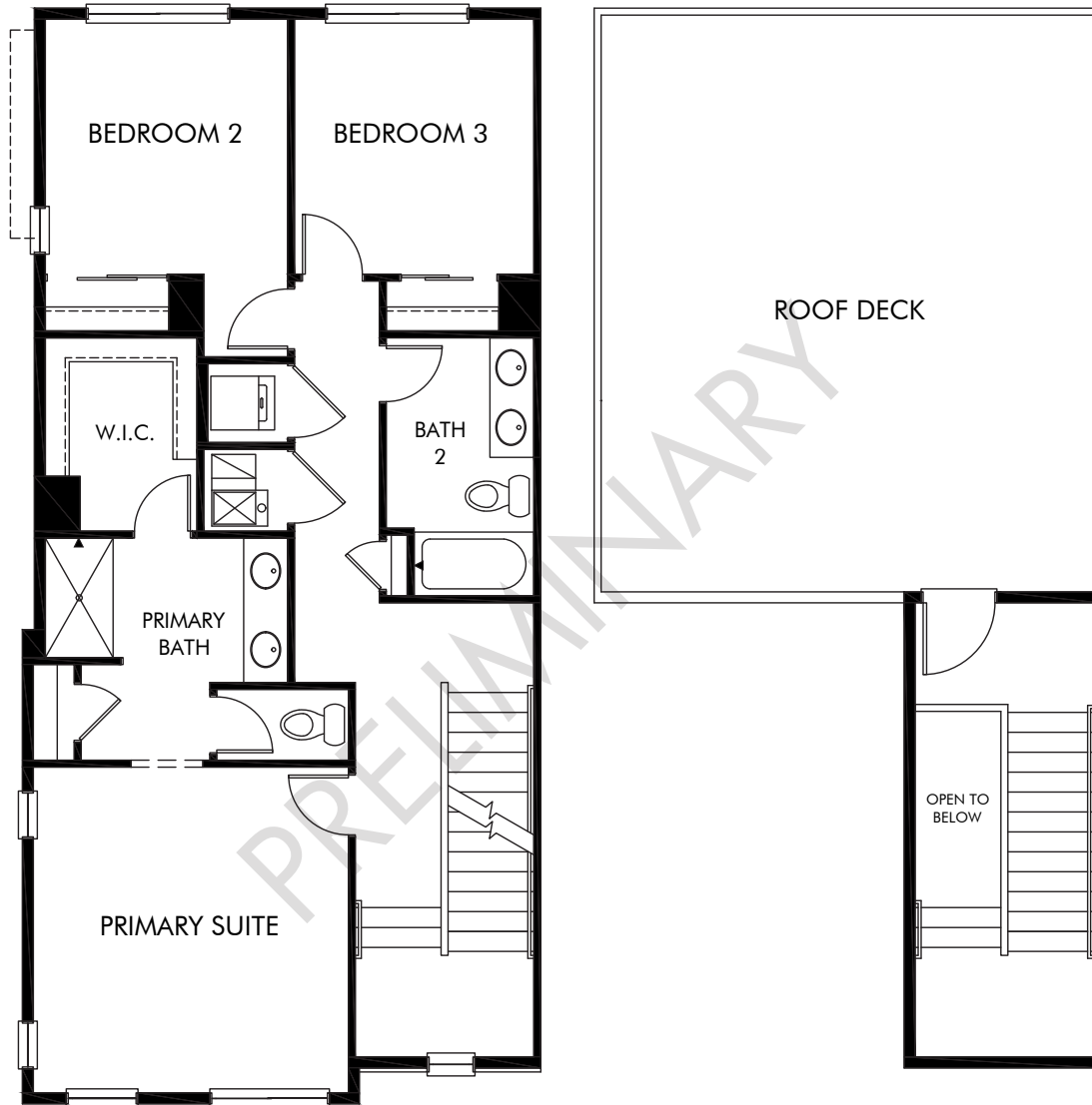
OPT. ROOF DECK

Community Name | The Crestone | Options 2,183 sq. ft. | 4 Bed | 3.5 Bath | 2 Bay Garage | 3 Story